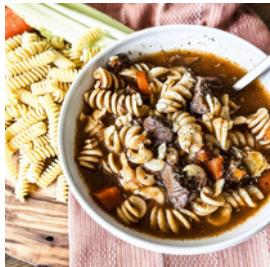
Beef and Noodle Soup