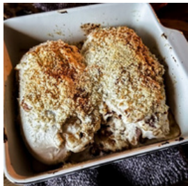
Cheese and Bacon Stuffed Chicken