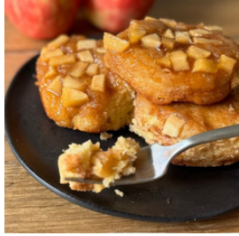
Einkorn Flour Apple Sticky Buns